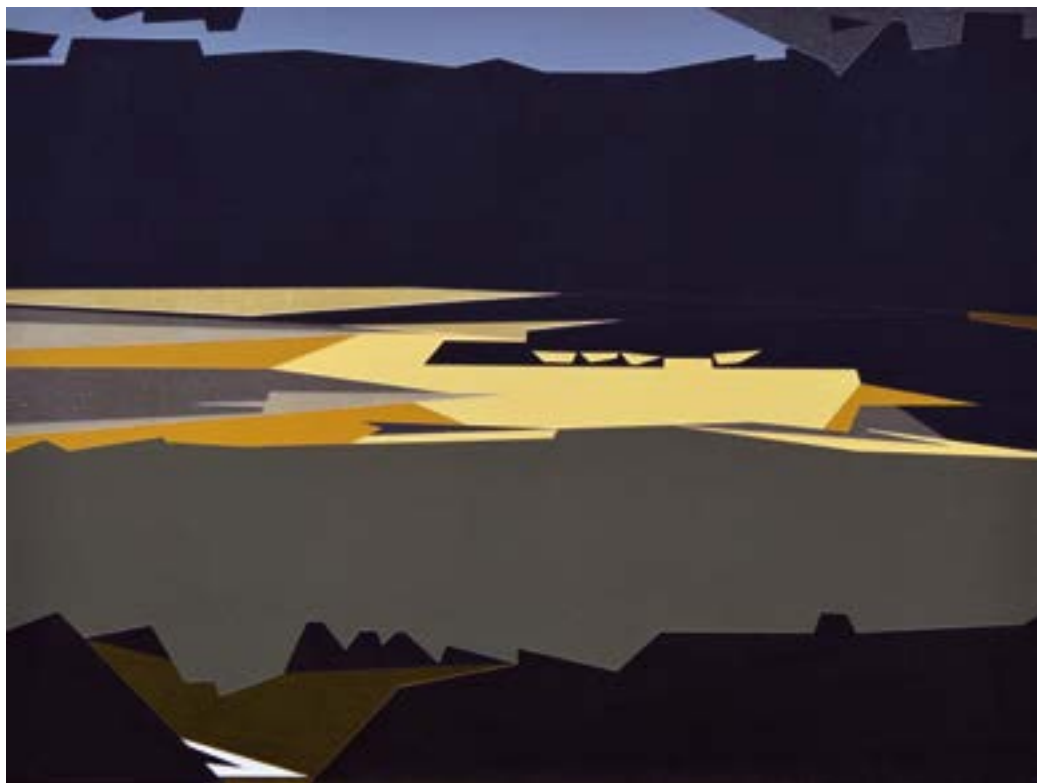
Crepúsculo - acrylic on canvas - 46 x 61 cm - 2018