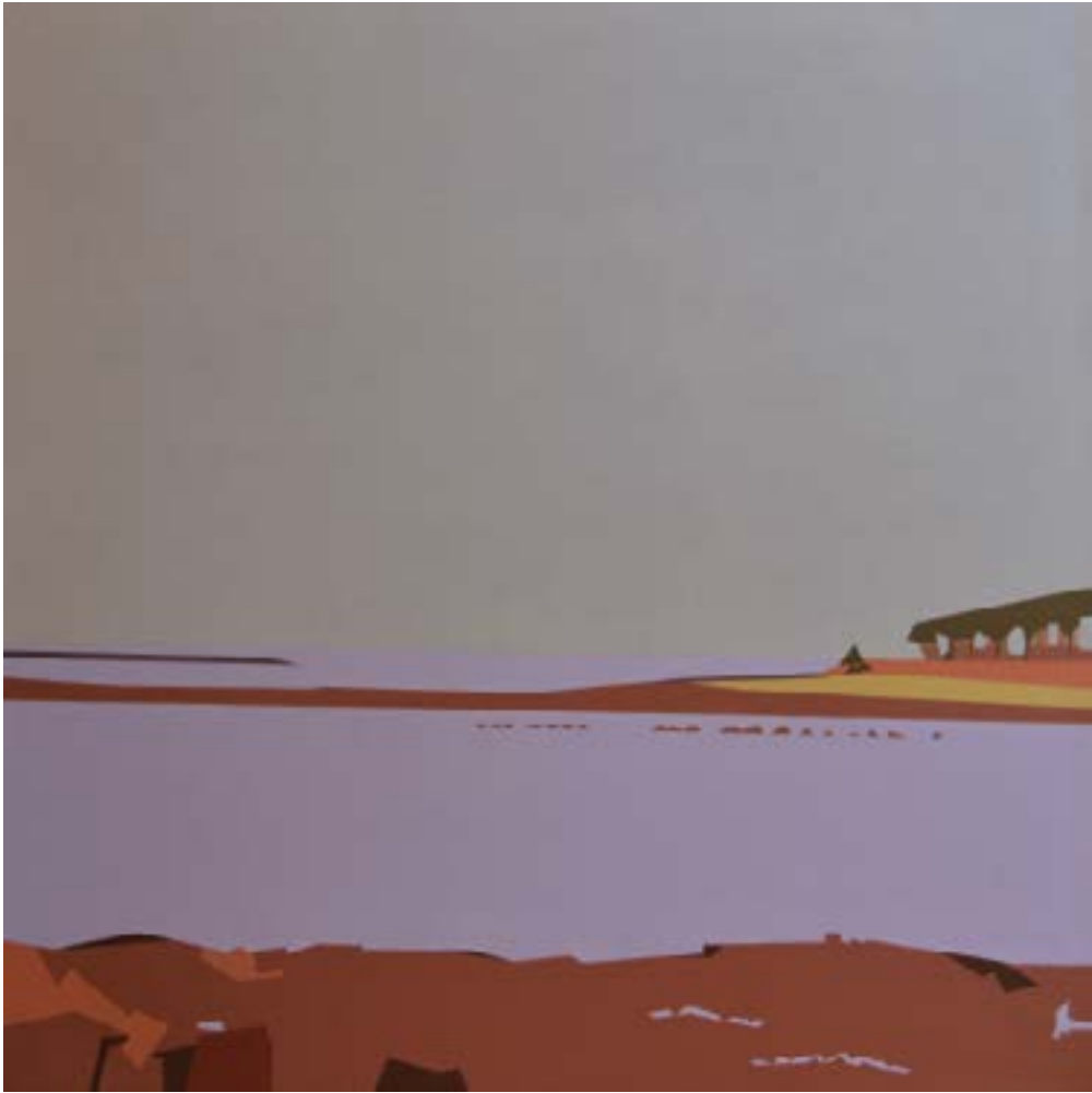
Grand calme - acrylic on canvas - 60 x 60 cm - 2018