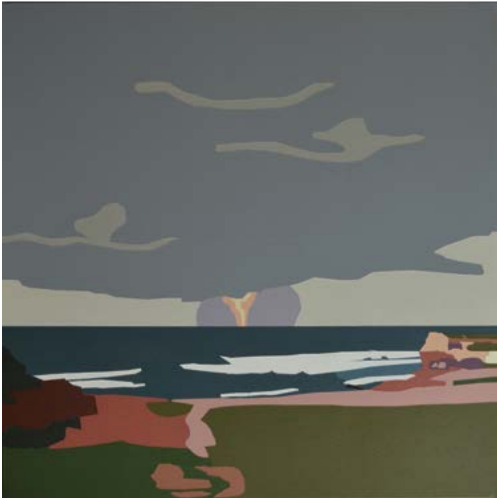
Rayo - acrylic on canvas - 60 x 60 cm - 2019