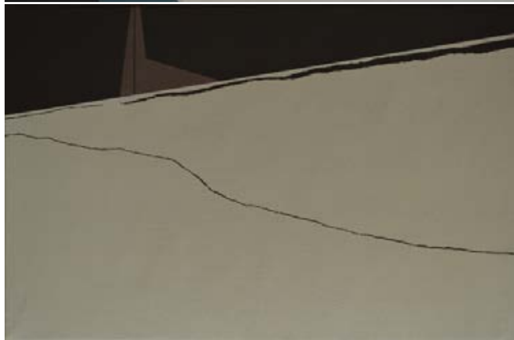
Fuga - acrylic on canvas - 61 x 38 cm - 2019