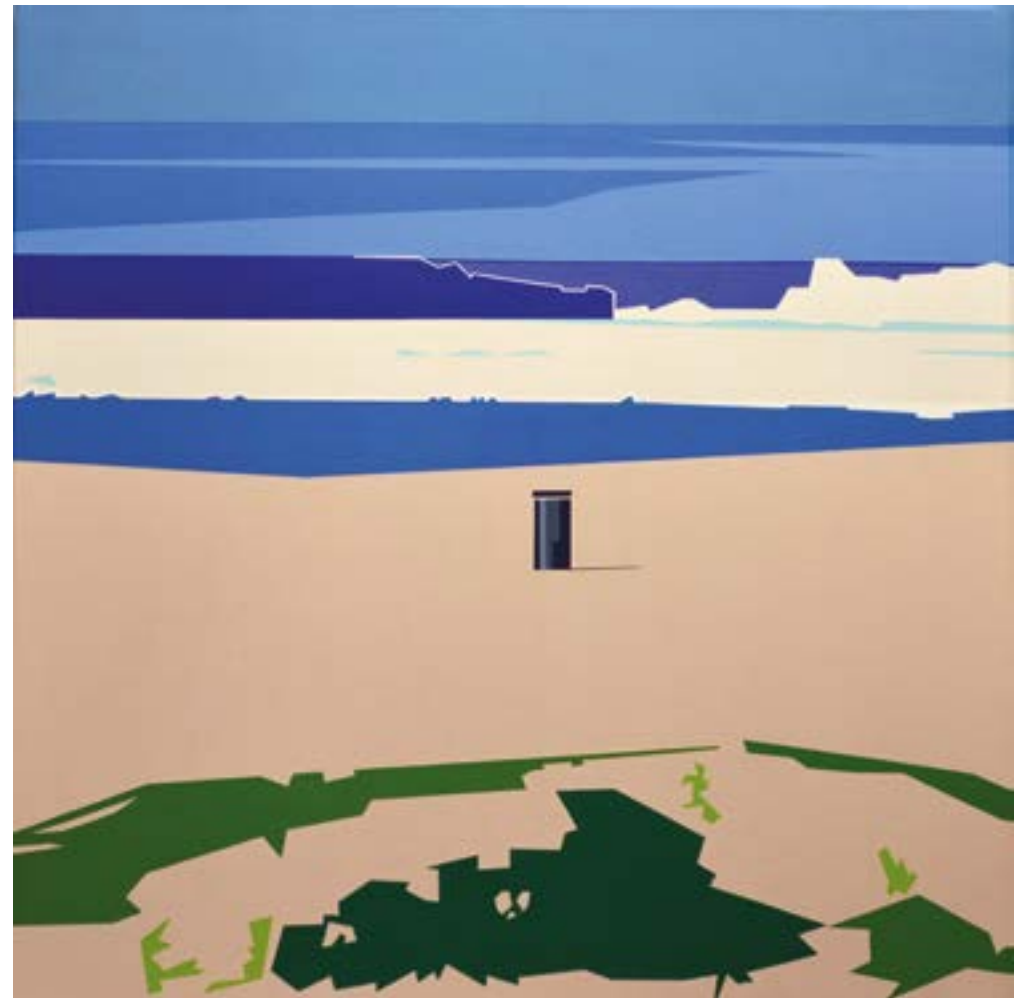
Trash can - acrylic on canvas - 60 x 60 cm - 2018