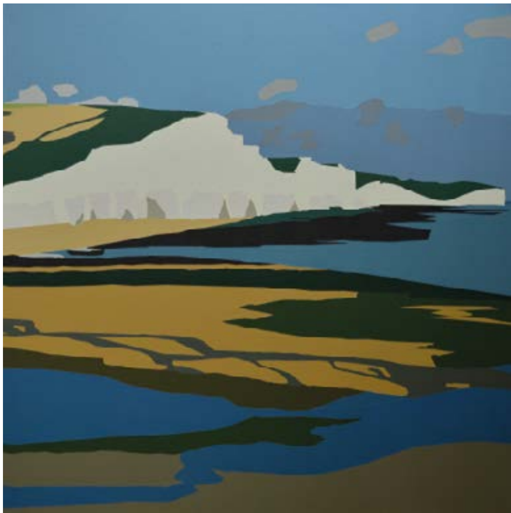
White wall - acrylic on canvas - 70 x 70 cm - 2019