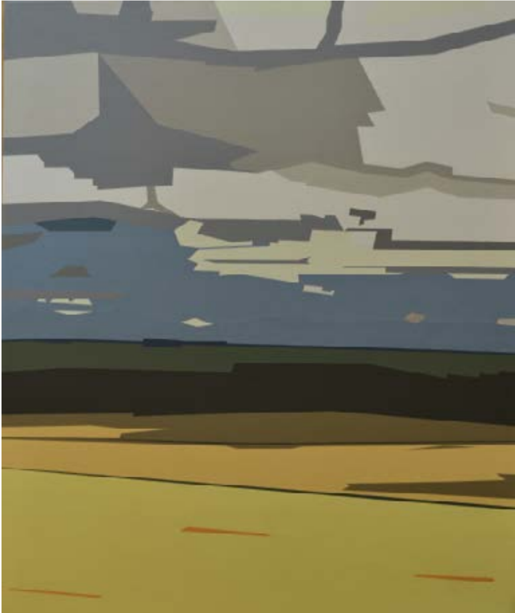
Oh nuages! - acrylic on canvas - 65 x 54 cm - 2018