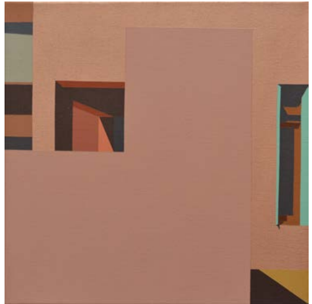
Pared rosa I - acrylic on canvas - 30 x 30 cm - 2017